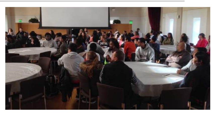
Students enjoying brunch at the February Saturday Session.

For our February Saturday Session, we held a couple of events on the same day. Freshmen, sophomores and juniors had a common application workshop where students were given details about the process of applying to college and the application itself from Wesleyan admission counselors. They also received a Financial Aid workshop where they learned the basics about applying for financial aid from Wesleyan financial aid officers. We also had a college panel and a financial aid analysis workshop for the seniors. Here the students learned how to pick the best school for