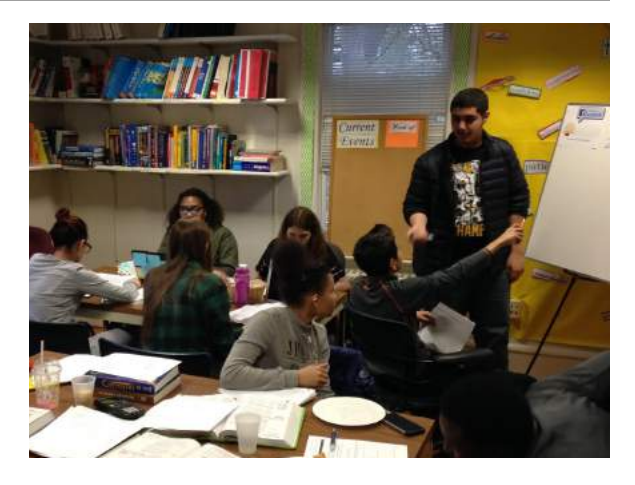
Tutors helping UBMS students during a study session.

Tutoring sessions are an integral facet of the UBMS program. We selectively hire tutors of various backgrounds and academic fields of study who are currently attending Wesleyan University. We highly encourage all of our students to take advantage of such a great and free resource at their disposal. This past semester we had tutoring on Tuesdays and Thursdays, after school 2:30-5pm at the UBMS office.